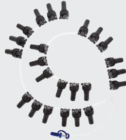
Fully Assembled Kit

Our watering system comes packaged in a kit specific to your battery's layout. We also provide a battery drawing to make the installation instructions easy to follow.